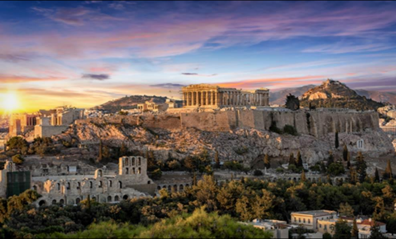
The Acropolis Museum