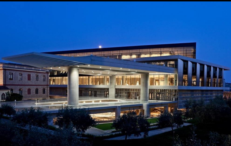
The Acropolis Museum